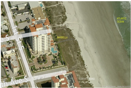
Built in 2005 - 22 units - 12 floors

MARBELLA OWNERS ASSOCIATION, INC. SENTRY MANAGEMENT INC 2180 W STATE SR 434 STE 5000 ONGWOOD FL 32779