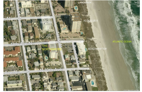
Built in 2006 - 35 units - 8 floors

NorthShore Management Company First Coast Association Management, LLC 11555 Central Parkway, Suite #801 Jacksonville, Florida 32224 (904) 998-5365 ext 223 (904) 998-5366 fax http://www.northshore32250.com/