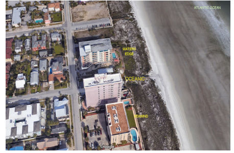
Built in 2003 - 10 units - 11 floors

Number of units: 10 Number of active listings for rent: 0 Number of active listings for sale: 0 Building inventory for sale: Number of sales over the last 12 months: 0% Number of sales over the last 6 months: 1 Number of sales over the last 3 months: 0