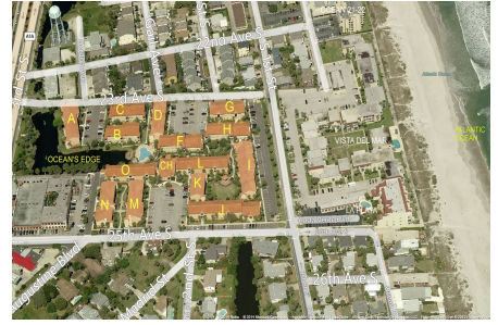
Built in 2006 - 181 units - 3 floors

OCEANS EDGE CONDOMINIUM ASSOCIATION INC VISTA COMMUNITY ASSOCIATION MANAGMENT PHONE 407-682-3443 904-247-9052 http://www.oceansedgeliving.com/index.php