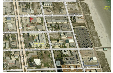
Built in 2007 - 58 units - 5 floors

PIER POINT CONDOMINIUMS ASSOCIATION OF JACKSONVILLE BEACH, INC. LA VILLA MANAGEMENT INC. 219 CRANES LAKE DR PONTE VEDRA BEACH FL 32082