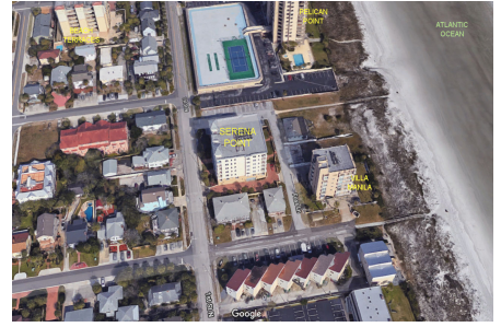
Built in 2006 - 17 units - 7 floors

Serena Point Condo Association 1809 1st St N, Jacksonville Beach, FL 32250 (904) 246-4370