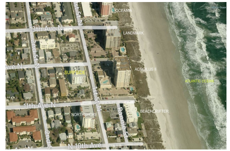
Built in 2007 - 25 units - 6 floors

SURFSIDE CONDOMINIUM ASSOCIATION OF JACKSONVILLE BEACH, INC LELAND MANAGEMENT INC PHONE 407-447-9955 FAX 407-447-9899 http://www.surfsidecentral.com/