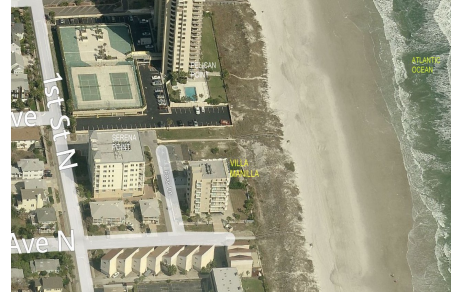
Built in 1984 - 11 units - 7 floors

Villa Manila Condominium Association Inc 5 17th Avenue North Apartment 402 Jacksonville Beach, FL 32250 Phone: (904) 246-5140