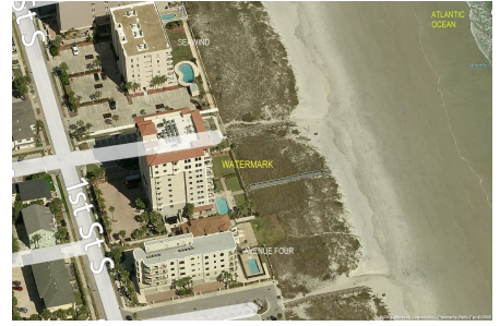
Built in 2005 - 25 units - 11 floors

THE WATERMARK CONDOMINIUM ASSOCIATION OF JACKSONVILLE BEACH, INC. LA VILLA MANAGEMENT INC. 219 CRANES LAKE DR PONTE VEDRA BEACH FL 32082 904-285-8316