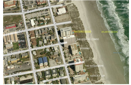
Built in 2006 - 16 units - 7 floors

Water's Edge Luxury Oceanfront Condominiums 212 3rd Avenue South Jacksonville Beach, FL 32250