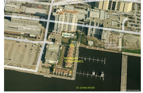
Built in 2002 - 20 units - 2 floors

Plaza Condominium Association-Berkman Address: 400 E Bay St, Jacksonville, FL 32202, Phone:+1 904-359-5938 http://www.theplaza1.com/