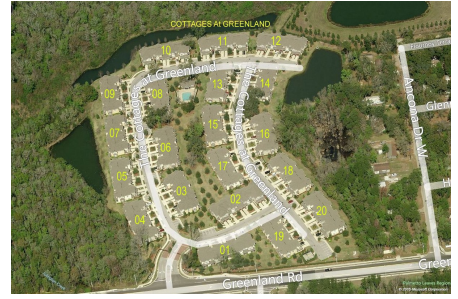
Built in 2006 - 160 units - 2 floors

The Cottages At Greenland Condo Assoc 6620 South Point Drive South # 610 Jacksonville, FL 32256 Phone: (904) 268-5861