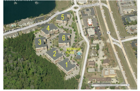
Built in 2005 - 182 units - 5 floors

Number of units: 182 Number of active listings for rent: 0 Number of active listings for sale: 5 Building inventory for sale: 2% Number of sales over the last 12 months: 10 Number of sales over the last 6 months: 5 Number of sales over the last 3 months: 2