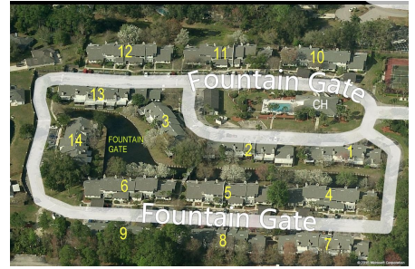
Built in 1984 - 97 units - 2 floors

FOUNTAIN GATE CONDOMINIUM ASSOCIATION, INC. STELLAR PROPERTIES OF NORTH FLORIDA INC 3015 HARTLEY RD JACKSONVILLE FL 32257 PHONE 904-886-1789