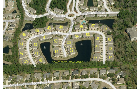
Built in 2005 - 184 units - 2 floors

Wolf Creek Condominium Association Address: 13364 Beach Blvd, Jacksonville, FL 32224 Phone:+1 904-992-6604