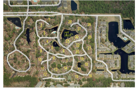
Built in 1993 - 284 units - 2 floors

Number of units: 284 Number of active listings for rent: 1 Number of active listings for sale: 6 Building inventory for sale: 2% Number of sales over the last 12 months: 11 Number of sales over the last 6 months: 5 Number of sales over the last 3 months: 2