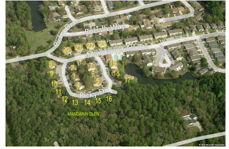
Built in 1985 - 92 units - 2 floors

Mandarin Glen Homeowners Association Address: 7235 Bonneval Rd, Suite 270 Jacksonville, FL 32256 Phone: (904) 220-8009 Fax: (904) 592-2270 http://mandaringlen.com/main.php?IMenuID=2115