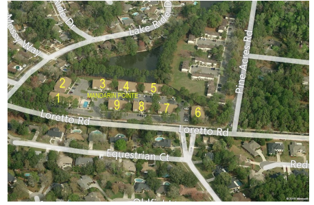
Built in 1986 - 78 units - 2 floors

MANDARIN POINTE CONDOMINIUM ASSOCIATION, INC. LELAND MANAGEMENT INC 10175 FORTUNE PARKWAY STE 906 JACKSONVILLE FL 32256 PHONE 407-447-9955 FAX 407-447-9899