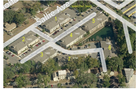
Built in 2006 - 112 units - 2 floors

Manotak Oaks Condominiums 1470 Sallie Avenue Jacksonville, FL 32210 Phone: (904) 783-2816