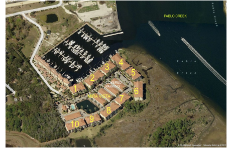
Built in 2005 - 150 units - 3 floors

Mira Vista Condominium Association 13846 Atlantic Blvd. #211 Jacksonville, FL 32225 http://miravistacondos.org/miravista/home.asp