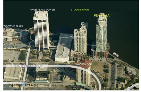
Built in 2008 - 234 units - 37 floors

Peninsula At St John Center 1431 Riverplace Blvd, Jacksonville, FL 32207 (904) 346-1946