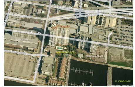
Built in 2003 - 206 units - 21 floors

Plaza Condominium Association-Berkman Address: 400 E Bay St, Jacksonville, FL 32202 Phone:+1 904-359-5938 http://www.theplaza1.com/