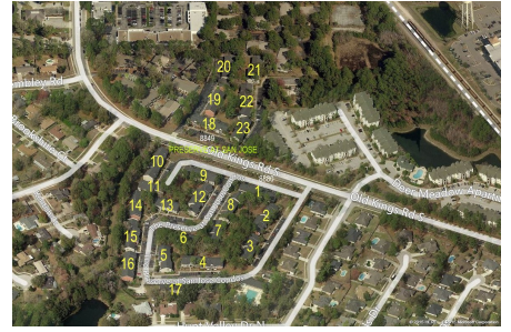
Built in 1974 - 196 units - 2 floors

Preserve At San Jose Address: 8880 Old Kings Rd S, Jacksonville, FL 32257 Phone: +1 904-731-1200 http://www.thepreserveatsanjose.org/