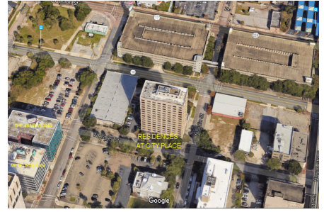
Built in 1949 - 205 units - 17 floors

Residences at City Place 311 West Ashley Street Jacksonville, FL 32202 Phone: (904) 358-2489 Fax: (888) 847-8438 http://www.cityplacejacksonville.com/