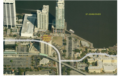
Built in 2007 - 141 units - 21 floors