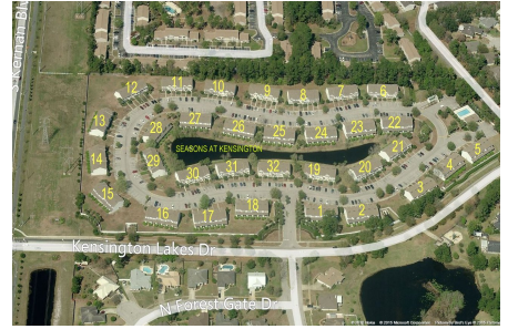
Built in 1998 - 192 units - 2 floors

KENSINGTON ASSOCIATION, INC. BCM SERVICES, INC. PO BOX 161088 JACKSONVILLE FL 32266 PHONE 907-242-0666 FAX 907-242-0670 http://www.kensingtonassociation.com/kensingtonassociation/page.html