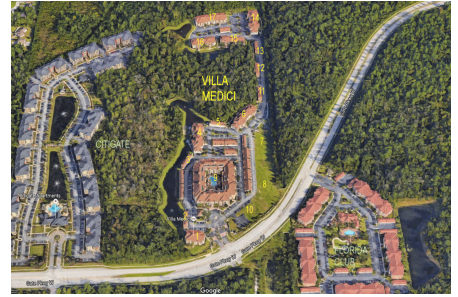
Built in 2007 - 379 units - 4 floors

Villa Medici Condo Assoc Inc Address: 8539 Gate Pkwy W, Jacksonville, FL 32216 Phone:+1 904-296-2216