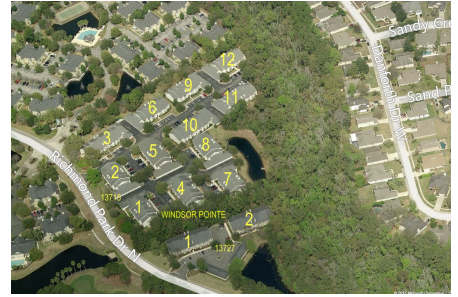
Built in 2001 - 112 units - 2 floors

Number of units: 112 Number of active listings for rent: 1 Number of active listings for sale: 1 Building inventory for sale: 0% Number of sales over the last 12 months: 2 Number of sales over the last 6 months: 1 Number of sales over the last 3 months: 0