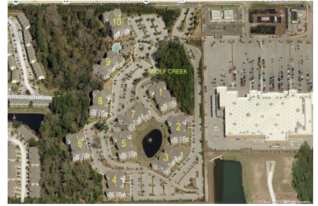
Built in 2006 - 400 units - 4 floors

Wolf Creek Condominium Association Address: 13364 Beach Blvd, Jacksonville, FL 32224, Phone:+1 904-992-6604