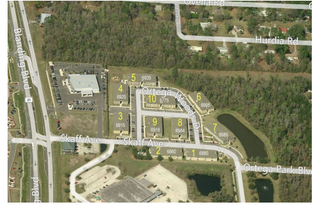
Built in 2007 - 160 units - 2 floors

Woods Of Ortega Condominium Association Inc 5455 A1a South Saint Augustine, FL 32080 Phone: (904) 584-1160