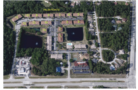
Built in 2005 - 200 units - 2 floors

Palm Pointe Property Management Company Address: 2275 FL-100, Bunnell, FL 32110, Phone: 386-437-3787 http://www.palmpointe.com/html/index.html