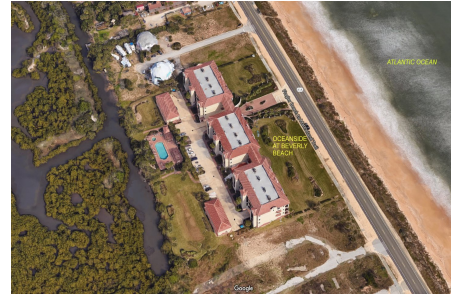
Built in 2007 - 34 units - 3 floors