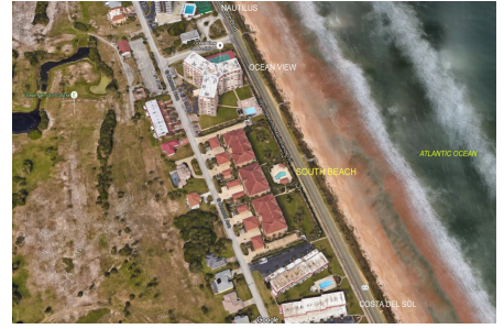
Built in 2001 - 42 units - 3 floors