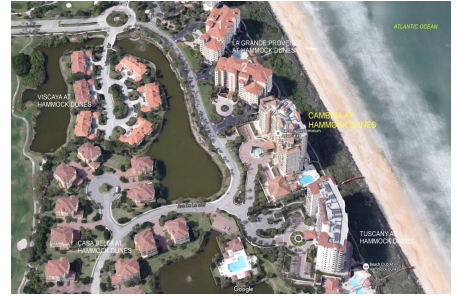
Built in 2005 - 60 units - 11 floors

Hammock Dunes Bridge Association Southern States Management Group 2 Camino del Mar Palm Coast, FL 32137 (386) 446-6333 http://daytonapropertymanagement.com/community/cambria-at-hammock-dunes-condominium