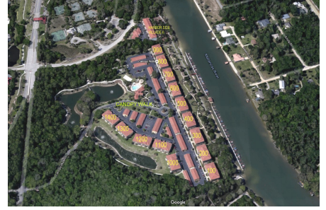
Built in 2004 - 242 units - 4 floors

Canopy Walk Address: 800 Canopy Walk Ln, Palm Coast, FL 32137 http://www.canopywalkca.com/canopywalk/home.asp