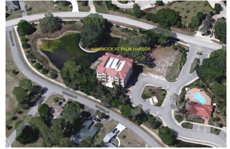
Built in 2011 - 7 units - 4 floors

THE HAMMOCK AT PALM HARBOR CONDOMINIUM ASSOCIATION, INC. 100 MISTY HARBOR TRACE, PALM COAST, FL, 32137