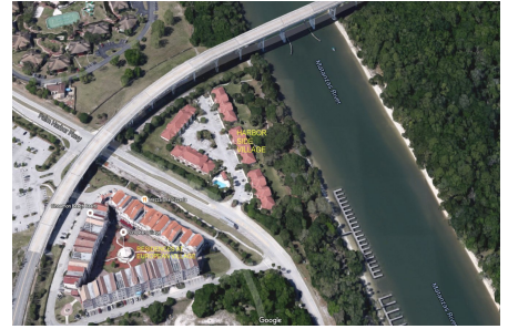
Built in 2001 - 30 units - 2 floors

HARBOR SIDE VILLAGE CONDOMINIUM ASSOCIATION, INC. 100 PALM HARBOR PKWY PALM COAST FL 32137 Mailing Address P.O. BOX 352672, PALM COAST FL 32135