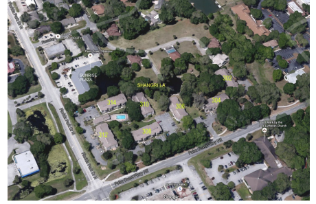
Built in 1975 - 56 units - 2 floors

Number of units: 56 Number of active listings for rent: 0 Number of active listings for sale: 0 Building inventory for sale: Number of sales over the last 12 months: 0% Number of sales over the last 6 months: 1 Number of sales over the last 3 months: 1