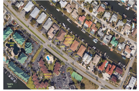
Built in 1982 - 23 units - 1 floor

Apollo Beach Condo Association P.O. Box 3612 Apollo Beach, FL 33572 (813) 645-4145