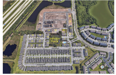
Built in 2015 - 184 units - 2 floors

Number of units: 184 Number of active listings for rent: 1 Number of active listings for sale: 1 Building inventory for sale: 0% Number of sales over the last 12 months: 12 Number of sales over the last 6 months: 4 Number of sales over the last 3 months: 2