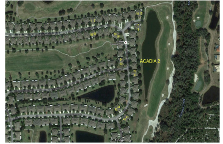
Built in 2001 - 66 units - 1 floor