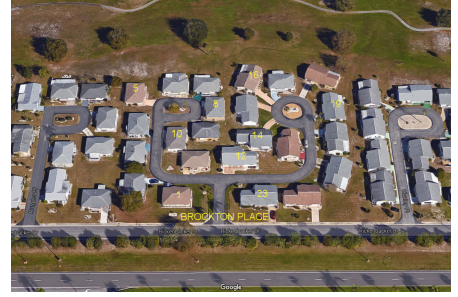
Built in 1975 - 23 units - 1 floor

Number of units: 23 Number of active listings for rent: 0 Number of active listings for sale: 2 Building inventory for sale: 8% Number of sales over the last 12 months: 2 Number of sales over the last 6 months: 2 Number of sales over the last 3 months: 1