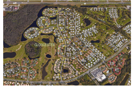
Built in 1980 - 402 units - 1 floor

1904 Clubhouse Dr Sun City Center Ph: 813-642-8790 URL: http://kpscc.com/