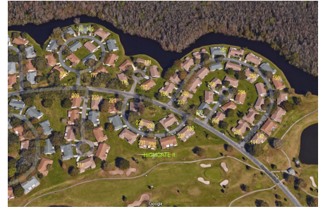
Built in 1982 - 122 units - 1 floor

Number of units: 132 Number of active listings for rent: 0 Number of active listings for sale: 6 Building inventory for sale: 4% Number of sales over the last 12 months: 6 Number of sales over the last 6 months: 1 Number of sales over the last 3 months: 1