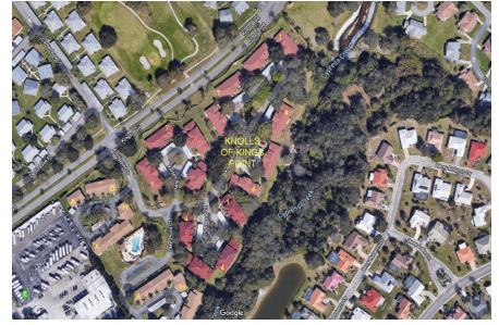
Built in 1982/1990 - 106 units - 2 floors

Kings Point Management LLC Address: 1904 Clubhouse Dr, Sun City Center, FL 33573 Phone: +1 813-642-8990