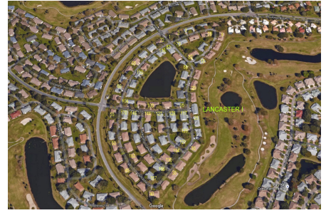
Built in 1987 - 170 units - 1 floor

Number of units: 170 Number of active listings for rent: 0 Number of active listings for sale: 9 Building inventory for sale: 5% Number of sales over the last 12 months: 7 Number of sales over the last 6 months: 1 Number of sales over the last 3 months: 0