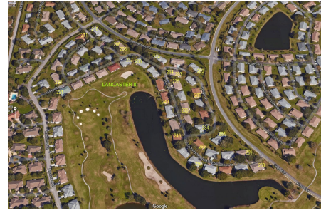
Built in 1989 - 104 units - 1 floor

Number of units: 104 Number of active listings for rent: 1 Number of active listings for sale: 3 Building inventory for sale: 2% Number of sales over the last 12 months: 2 Number of sales over the last 6 months: 1 Number of sales over the last 3 months: 1