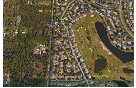
Built in 1991 - 156 units - 1 floor