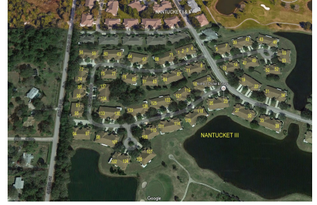
Built in 1994 - 137 units - 1 floor

Number of units: 137 Number of active listings for rent: 1 Number of active listings for sale: 0 Building inventory for sale: Number of sales over the last 12 months: 0% Number of sales over the last 6 months: 7 Number of sales over the last 3 months: 3