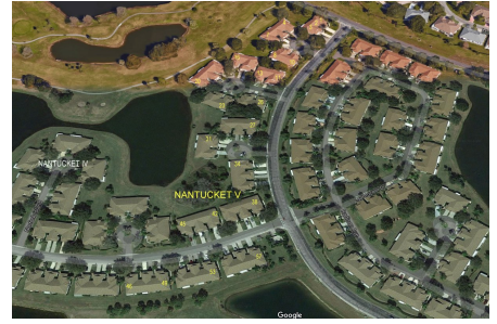
Built in 1997 - 57 units - 1 floor

Number of units: 57 Number of active listings for rent: 0 Number of active listings for sale: 2 Building inventory for sale: 3% Number of sales over the last 12 months: 4 Number of sales over the last 6 months: 3 Number of sales over the last 3 months: 3